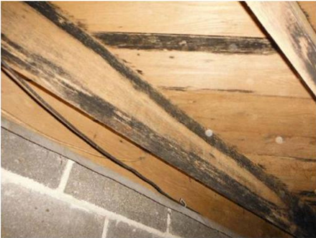
Fungi stains on floor joists, subfloor, sills