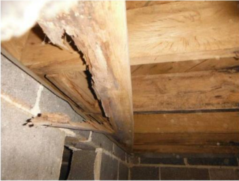
Termite tunnel stains on block