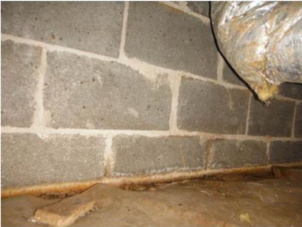
Termite tunnel stains on block