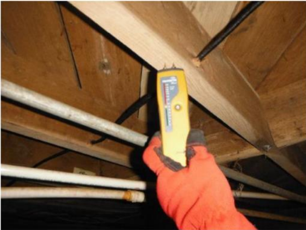
Moisture reading 16%