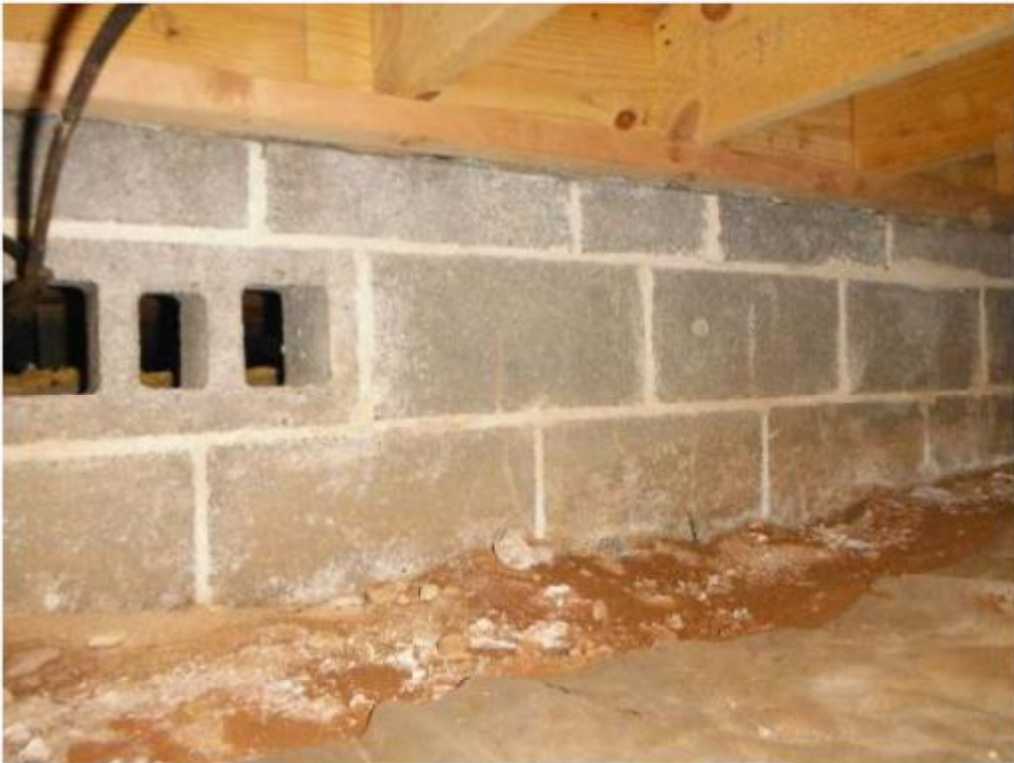
Termite tunnel stains on block