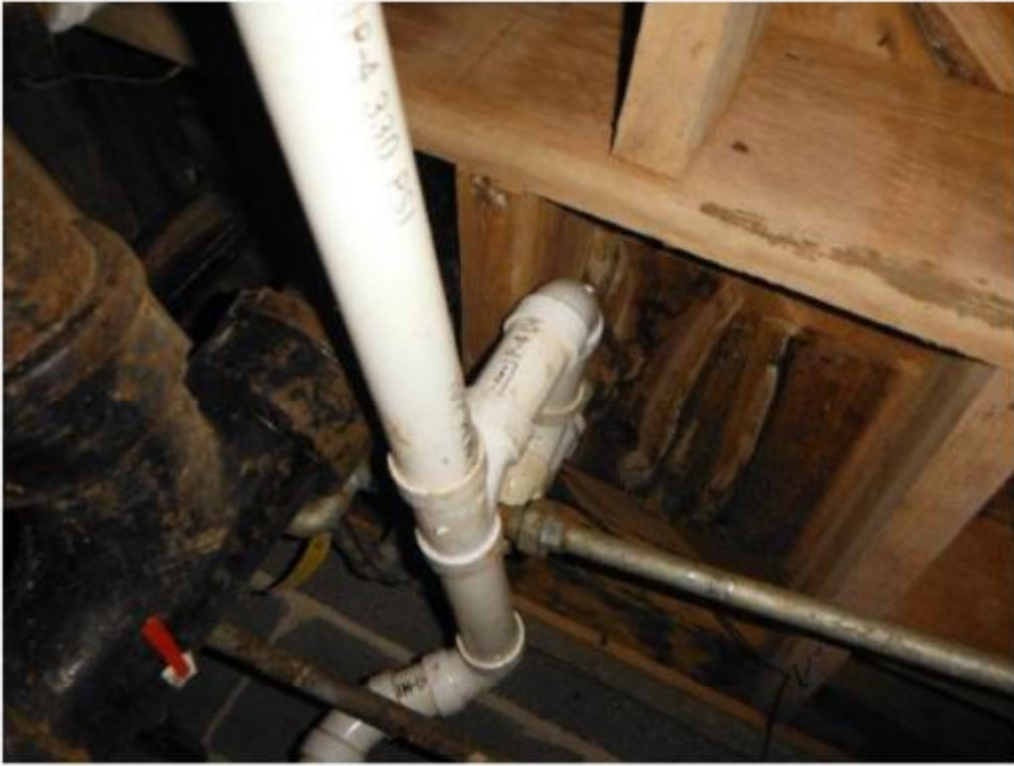
Fungi stains on floor joists, subfloor, sills